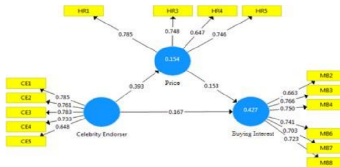
Figure 2. Full Model

From the results of data testing using SmartPLS 3, the output includes visuals or images that explain the relationship between research variables or research hypotheses. In the picture, we will also be able to find out each loading factor value or the validity of each question item or indicator of each research variable. Can be seen the value of the regression coefficient to measure each of the existing research hypotheses. While the second form of output is in the form of a table that explains whether the research hypothesis is accepted or not. The following is a summary of the results of data testing with SmartPLS 3: