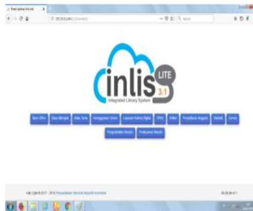
Figure 2. Inlis Start Page

The display of the library information system (Inlis Application) at the Office of Archives and Libraries of West Sumatra Province, can be seen in the following picture: