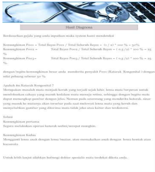
Fig 3: Prediction Result