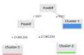
Figure 5. Mapping with the ID3 Method

Based on the results of the estimation of the testing data, it can be concluded that positive data >= 6129 are classified in cluster-2 and <2544 are classified as cluster-1. The following is the test results of estimation or prediction analysis with Rapid Miner 9.5.001, entering training data from the results of previous k-means data analysis on new data or testing and combining the mapping results with the ID3 method in Figure 5.