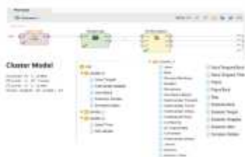
Figure 2. Testing the K-Means Method with Rapidminer

In cluster mapping (c0, c1 and c2) based on the final centroid values shown in Figure 3.