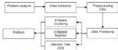
Figure 1. Stage of process in the research

The prediction of the pattern of the spread of covid-19 in Indonesia uses six stages. The stages are problem analysis, data collection, data processing, K-means clustering, prediction with k-Nearest Neighbor, distribution mapping with ID3 and analysis stage. The research method used in this research can be seen in Figure 1.