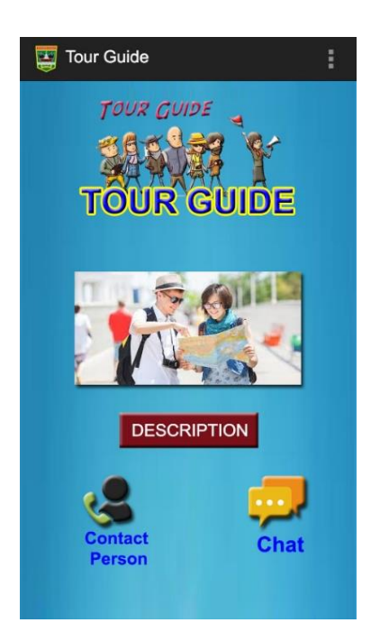
Figure 7: Display of tour guide