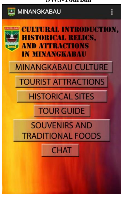
Figure 3: Main menu of SWS-Tourism