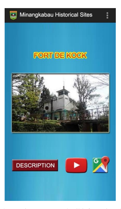
Figure 5: One of historical sites in West Sumatera