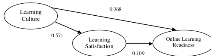
Figure 2. Conceptual Framework Hypothesis – 6

To calculate the indirect influence of the learning satisfaction variable, the Sobel Test is used which was developed by Sobel (1982), with the following formula: