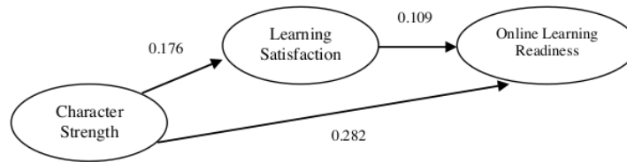
Figure 3. Conceptual Framework Hypothesis - 7

Next to assess the indirect influence given by the variable learning satisfaction in strengthening the influence of character strength on online learning readiness, the Sobel Test was developed by Sobel (1982), using the formula the following: